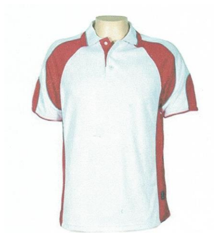
Figure 2: Previous KGSA Club Uniform

The previous Club uniform will be accepted for use until 31 December 2019.