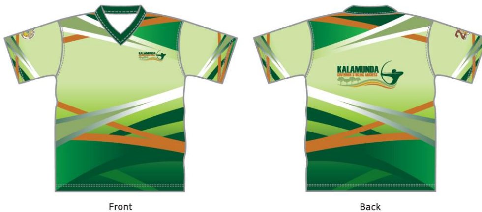
Figure 4: KGSA Club Uniform (V-Neck T-Shirt Style)