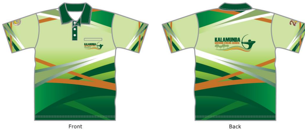
Figure 3: KGSA Club Uniform (Polo Style)