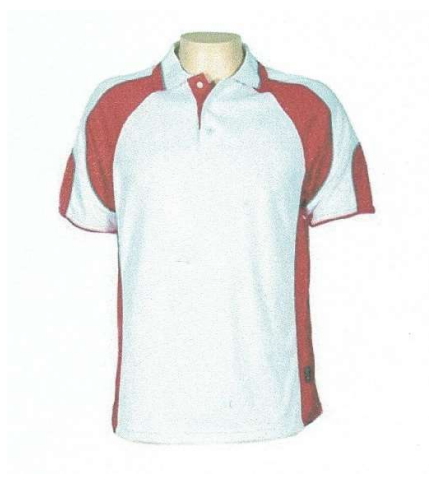
Figure 2: Previous KGSA Club Uniform

The previous Club uniform will be accepted for use until 31 December 2019.