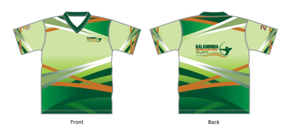
Figure 4: KGSA Club Uniform (V-Neck T-Shirt Style)