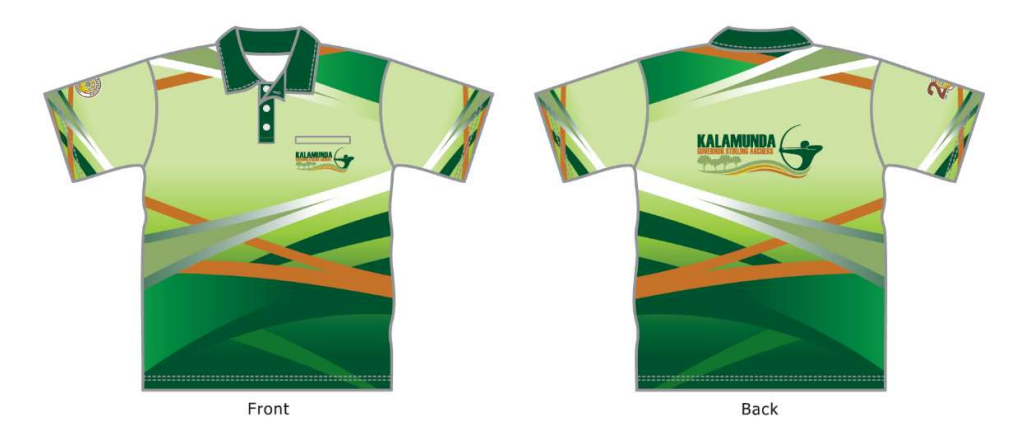
Figure 3: KGSA Club Uniform (Polo Style)